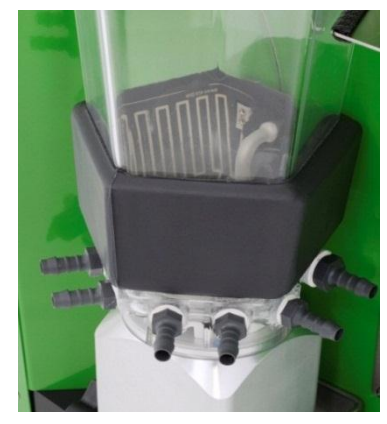
Fig. 5: Mixer jar with electrode and optional mixer heating

Thanks to the electrode in the mixer jar the portions will be dosed exactly. Even with high concentrations of milk powder a high mixing performance can be reached. Simultaneously it monitors the water lack of the machine. With the new ECO already the standard equipment allows for connection of up to 8 stations.