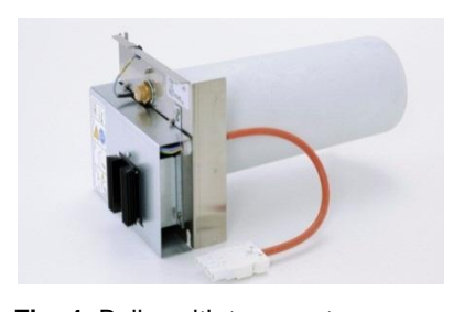
Fig. 4: Boiler with temperatures sensor and electronic heating control