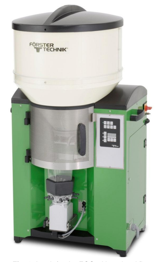
Fig. 1: Lamb feeder ECO with optional fly protection and mixer heating

New height-adjustable front plate with teat bracket (option)